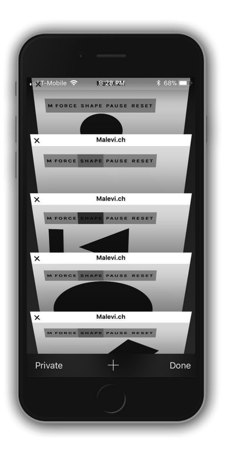
Figure 3: Screenshot of Malevi.ch app on a mobile device.

compositions. Deconstruction was, of course, the proto-digital movement concerned with visual instability that branded itself as a metonymic offspring of deconstructionist literary theory and constructivist art. But in her critique, Cooke points out that much of the architectural work missed the underlying themes of the Russian avant-garde: mysticism, infinity, dematerialization, and objectlessness. Had architects studied the movements closer, they would have realized that, "[Suprematism's] very otherness...provides a paradigm of a space-time universe, which is, naturally and logically, appropriate to the new perceptions of how the cognitive and phenomenal world of the late 20th century is operating."<sup>13</sup> And so for Cooke, the lessons that should be taken away from the Russian avant-garde are therefore not primarily visual at all, but rather deeply cosmological.